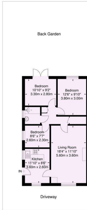
ILLUSTRATION FOR IDENTIFICATION PURPOSES ONLY ALL MEASUREMENT ARE MAXIMUM, AND INCLUDE WINDOW BAYS AND WARDROBES WHERE APPLICABLE THIS PLAN MUST NOT BE REPRODUCED BY ANY OTHER PERSON WITHOUT PERMISSION

18 Kentmere Drive Approximate Gross Internal Area = 70.6 sq m / 759 sq ft